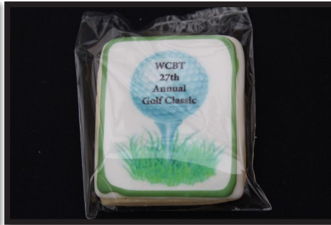
Official Tournament Cookie