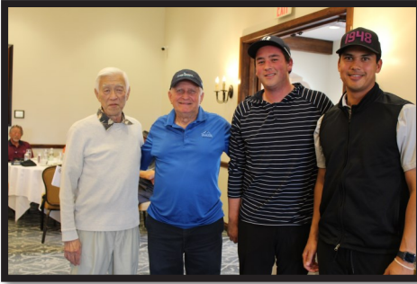
First Place Team