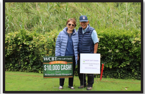
Hole In One Sponsor