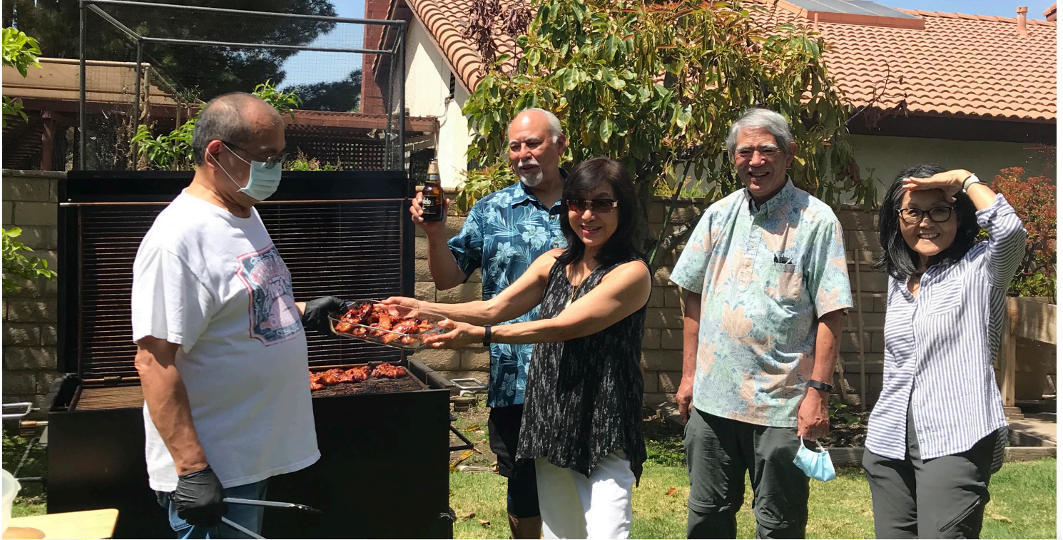
A few fully vaccinated seniors spent an afternoon testing out the brand new WCBT BBQ grill. It was the first step in getting our Sangha and the equipment ready for any upcoming fundraisers.