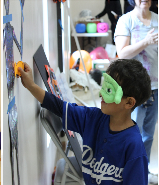
The annual WCHHT Halloween celebrations brought out the Dodger Replacement Team who had a ball playing games and taking home bags of sweets.