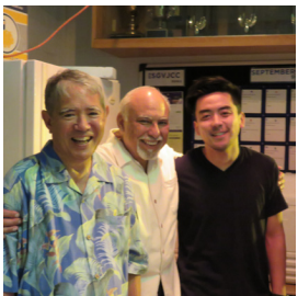
The bartenders at the WCBT Oldies dances are handsome, suave and youthful