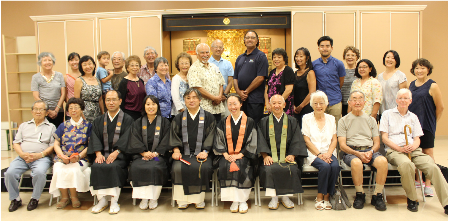
On a balmy evening, on the 13th of September, the WCBT Sangha observed its Fall Ohigan Service.