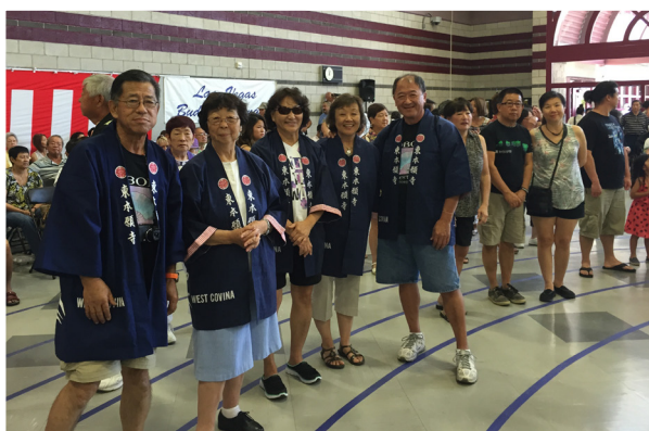
The WCBT Sangha proudly showed off their new happi coats as they lined up to dance at the Las Vegas Obon