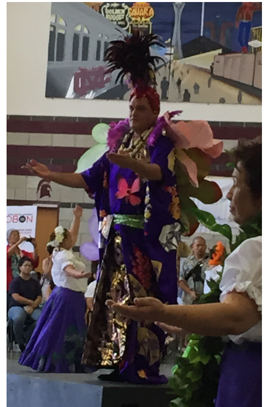
Las Vegas style Bon Odori!