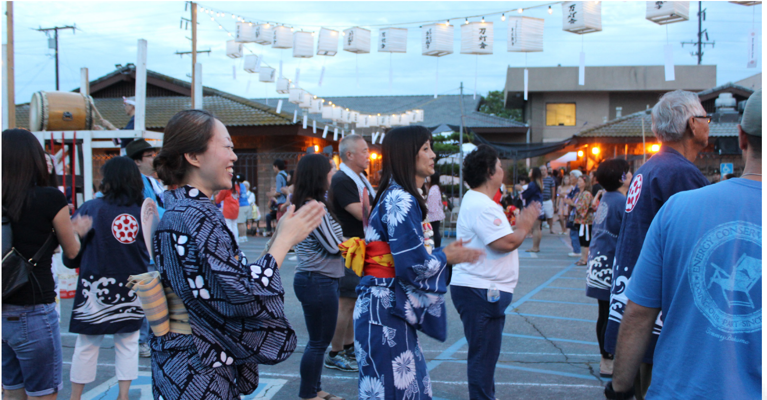
Every year the WCBT Obon is the happiest place on Earth for all its Sangha members who work hard and dance hard joyously.