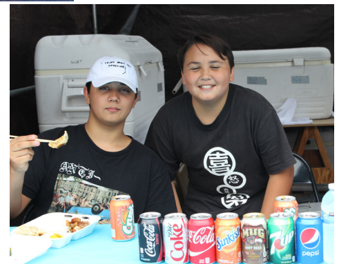
We imported our best and youngest workers all the way from Phoenix, AZ. The Godoy grandsons manned the soda booth like pros.