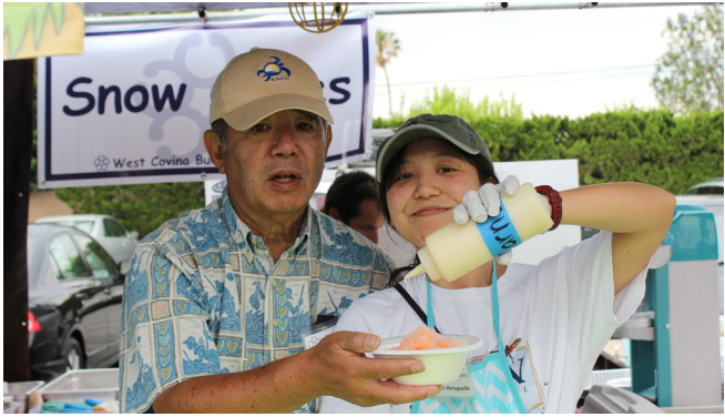
The new Hawaiian style shave ice was a big hit with the customers. Especially popular were the strawberry POG (passion, orange, guava) and the new green tea kintoki