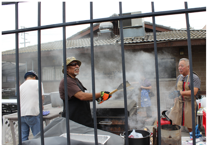
Some Sangha members were sentenced behind bars all day to barbeque chicken.