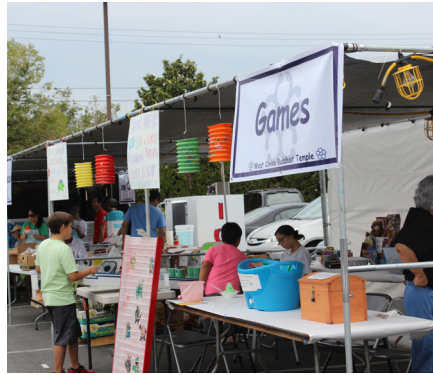
The Dharma School booth is popular with the under 10 crowd for its fun new games and great raffle prizes.