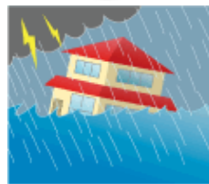
Our helpful Sangha members quickly picked up push brooms to sweep out the flooding waters that rushed into the the Sugimoto Social Hall right in the middle of our evening Hatsubon Service.