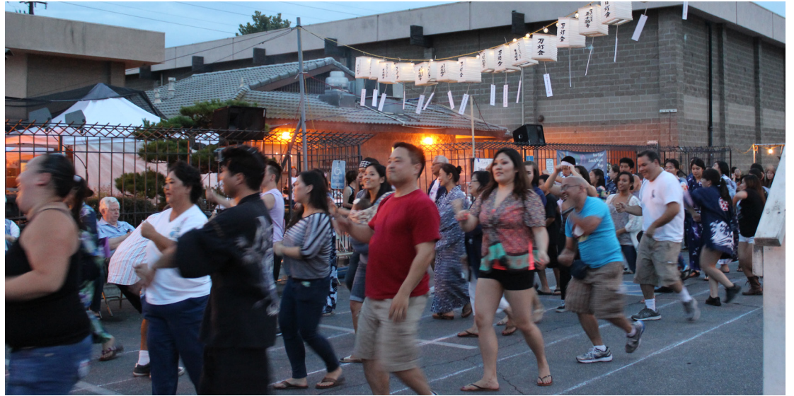
Dancers of all ages enjoyed the bon odori under the mantoe-lanterns