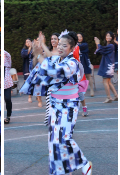
Our young Sangha members enjoyed the bon odori as they pranced joyfully around the yagura.