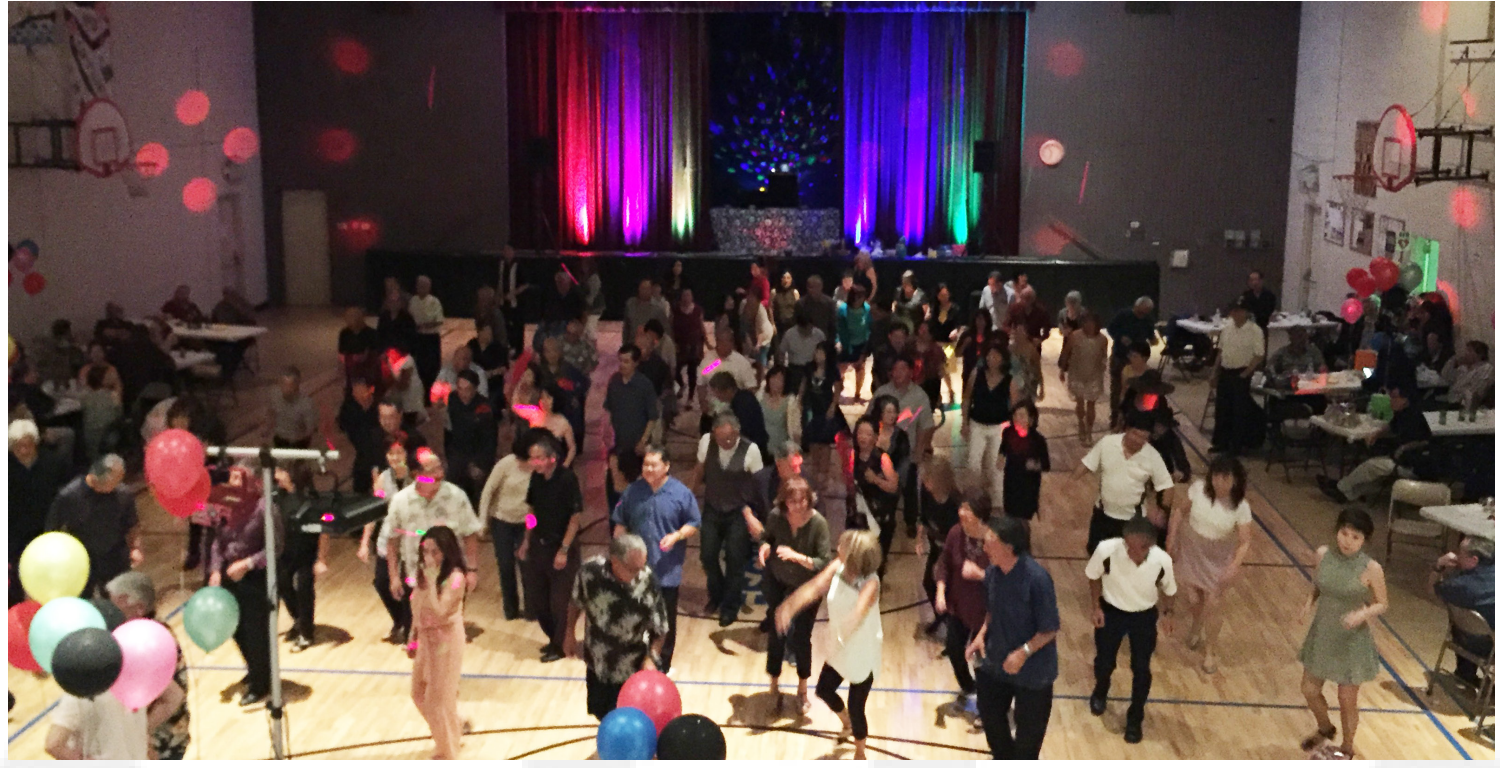
"Come Dance with Me at Oldies LIII (53)" was a great success as many friends and fellow dancers showed up with wings on their feet at our recent spring event.