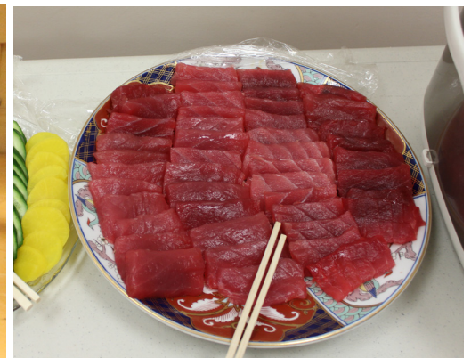
At the January 3, New Years Service, the star of the event was the mouth watering sashimi which required several trips to fully savor the essence of the sashimi....