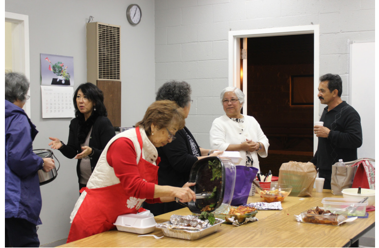
Toban C members organized the year end potluck buffet.