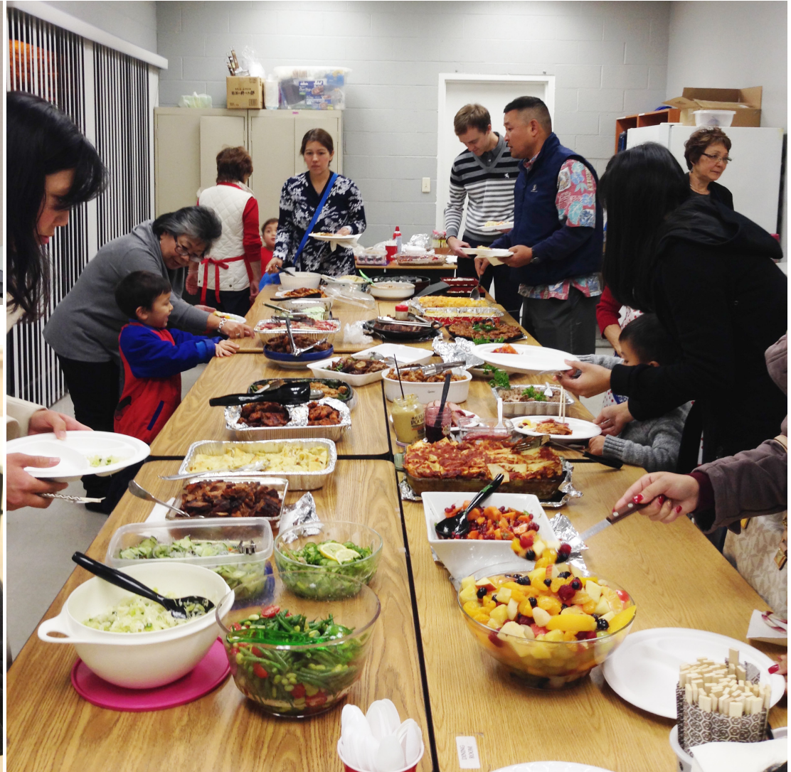
Our annual Year End potluck Feast!