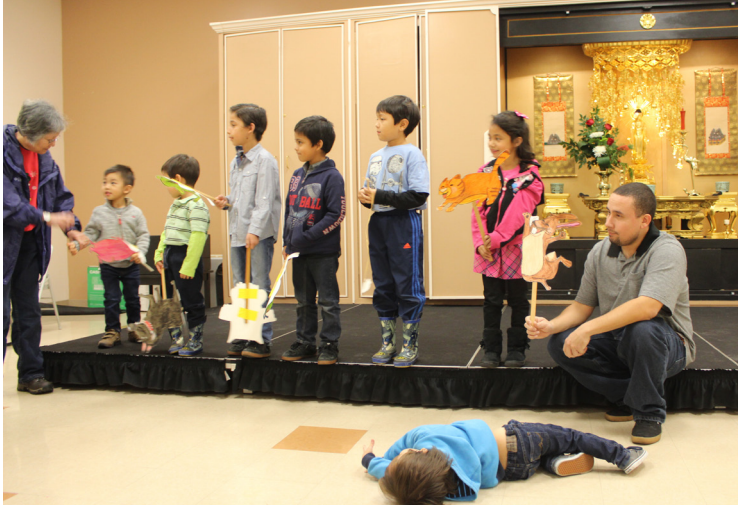
Dharma School children did a puppet story of a little frog.