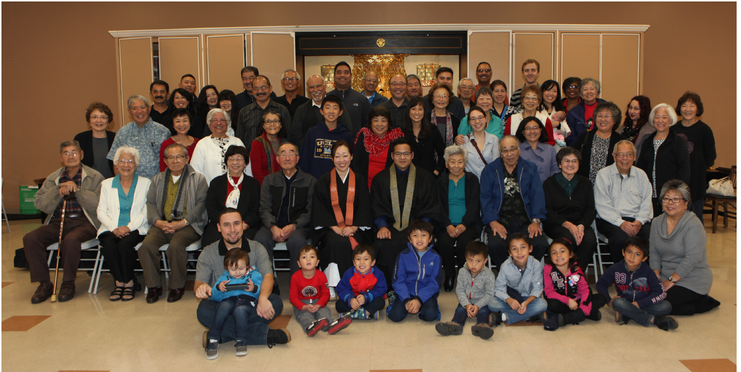
WCBT's Year End & Oseibo Service had a great turnout. Everyone posed patiently before stampeding to the Potluck feast.