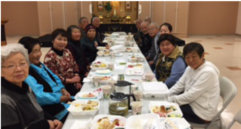
Howakai members celebrated their Year-End with their annual sashimi dinner.