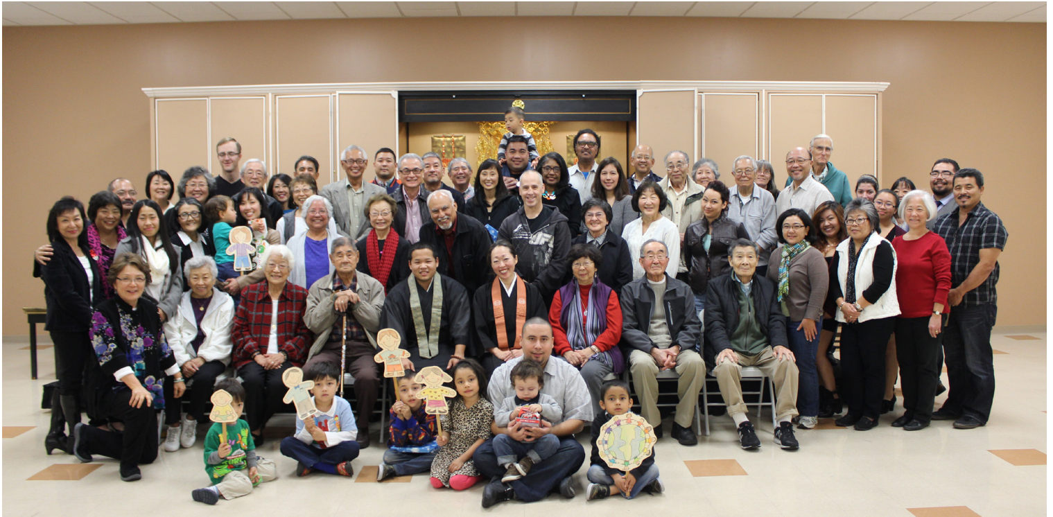
On December 21 Sangha members gathered to celebrate the Year-End and Oseibo service with a scrumptious potluck and a delightful program of musical entertainment.